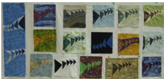
Flying geese designed in Barb Dawson's class