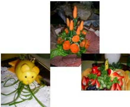
Some of the artistic food displays created by the staff at the Lodge

The Guild held its annual Spring Retreat at Cedar Lodge, Blackstrap on March 20-22. Guild members took classes or just spent the day sewing on their own projects in this lovely facility. We look forward to seeing many of these finished works at Show & Tell and the fall Quilt Show.